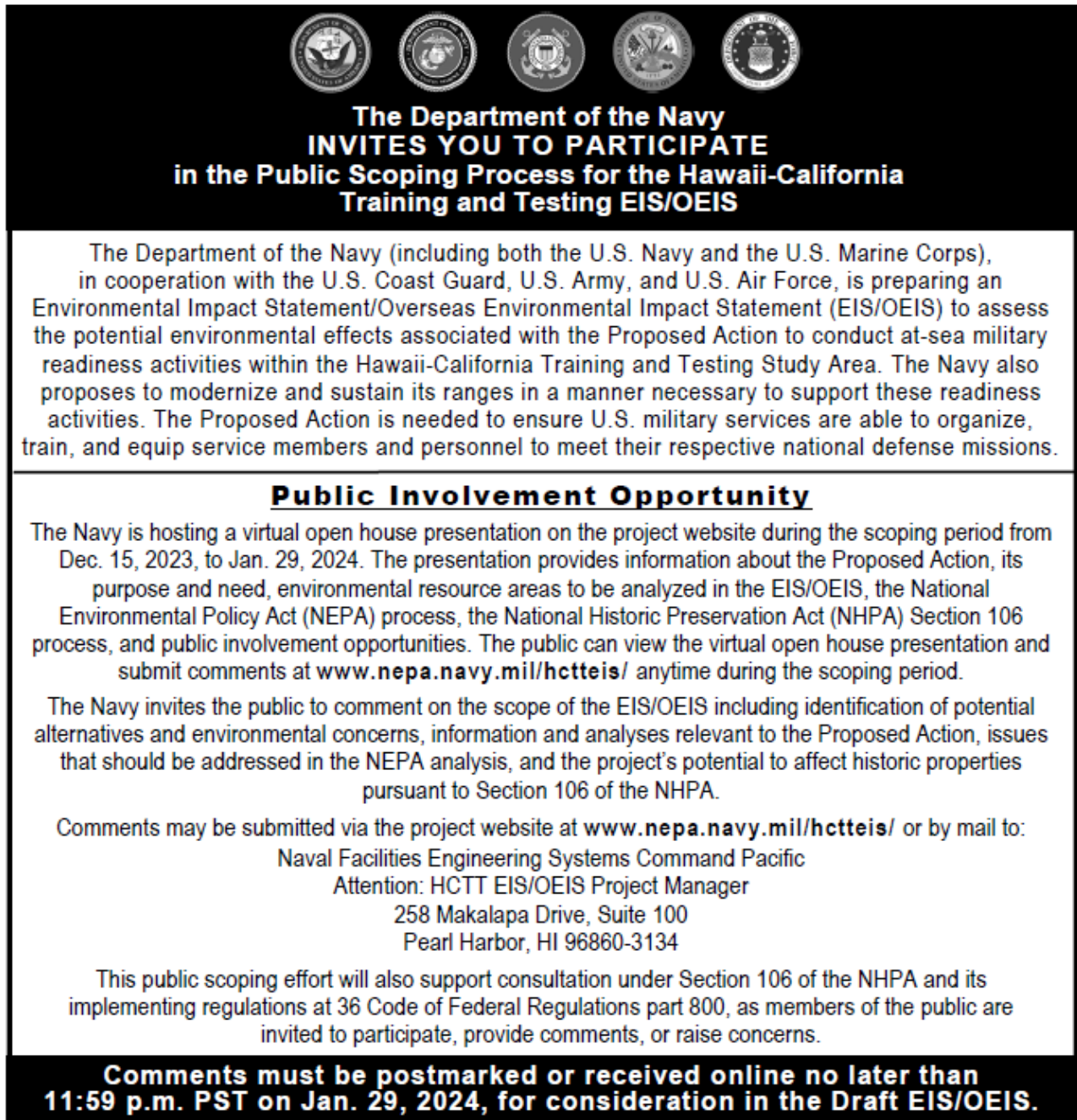
Figure L-2: Scoping Newspaper Advertisement