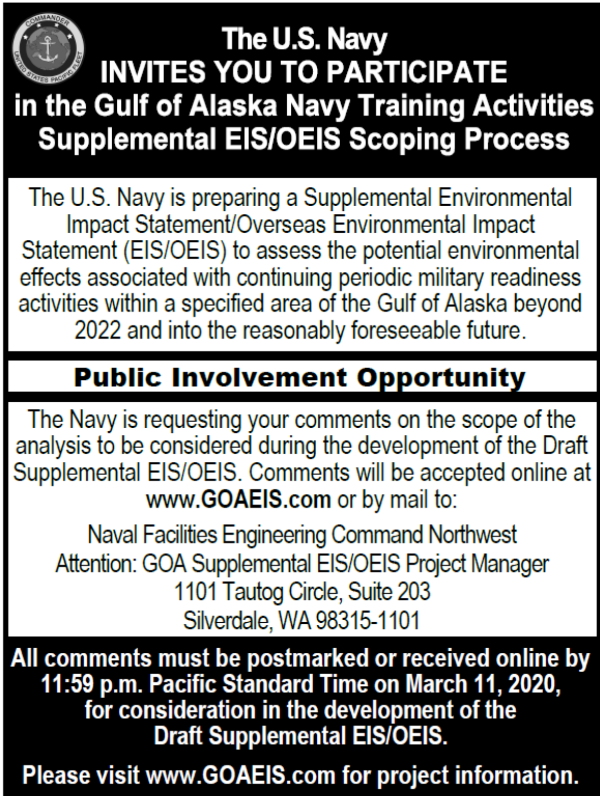
Figure F.2-3: Newspaper Announcement for Scoping